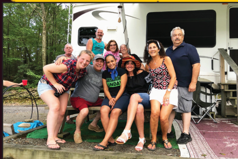
MPC Seasonal Family!