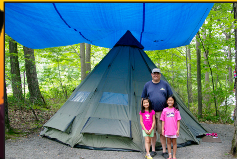
Our wooded tent sites.