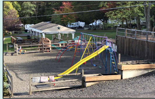
Playground, Beach Volleyball, Horseshoes, Boccie Ball, Croquet, Badminton, Ladder Golf, Quoits, Bean Bag Toss, Can Jam.

Discounts on Daily Site Rates: 10% AAA Members, with card. 10% Senior Citizen (65 & above). 10% Military (active and veteran), with ID. **Ask about our Scout Troop Rates.