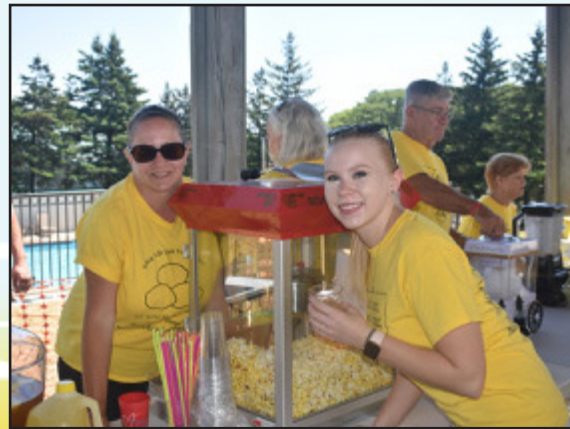
Alex's Lemonade Stand/Carnival.