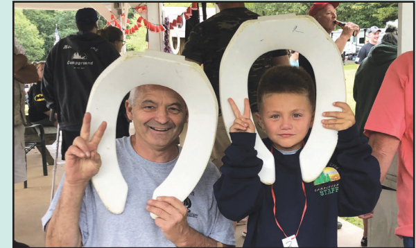
Toilet Seat Horseshoes!

For further details and a complete schedule, please check our website.