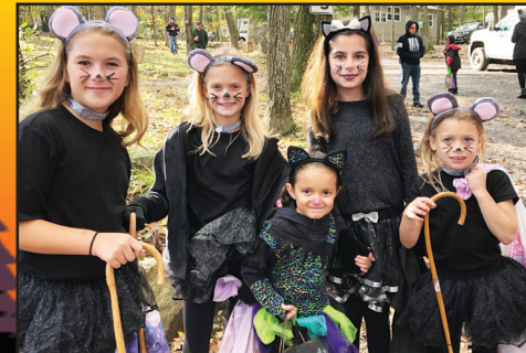
Trick or Treating!

GPS: N41 degrees, 14.11"/W 75 degrees, 58.9".